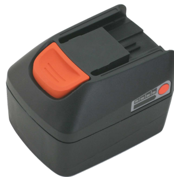
Spare Rechargeable Battery Type: EA-HB-740-Accu-250 Article No.: 020.010.296