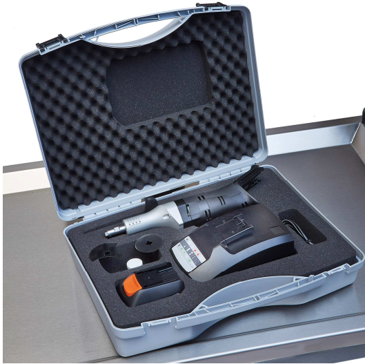
Plastic Case for Autopsy Saw HB-740-Accu-250 Type: K-HB-740-Accu-250 Article No.: 020.010.233