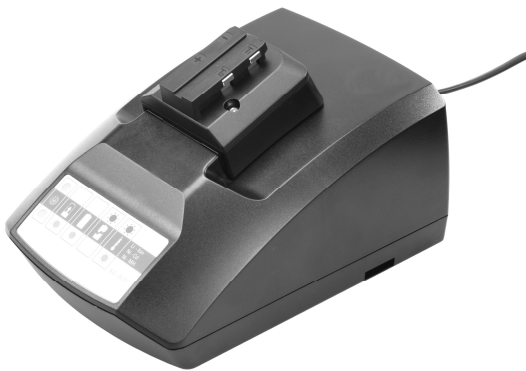
Charger for Autopsy Saw HB-740-Accu-250 Type: LG-HB-740-Akku-250 Article-No. 020.030.069